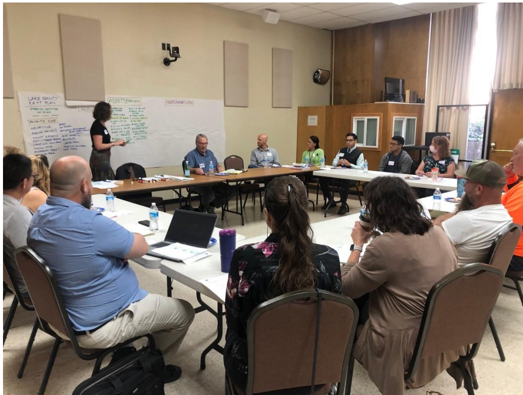
Lake County PRT Master Plan Steering Committee Meeting 1

In the first part of the meeting, the project team reviewed the purpose of the meeting and the reviewed planning process as a whole. The meeting then focused on Committee member discussion of strengths, challenges, needs, and opportunities for parks, recreation and trails, as detailed in the notes that follow.